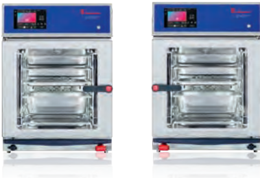
JOKER MT 1-1

The JOKER MT 2-3 is also available with 230V. All units are available with a silver control panel.