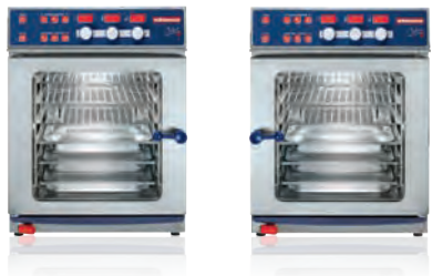
JOKER B 2-3