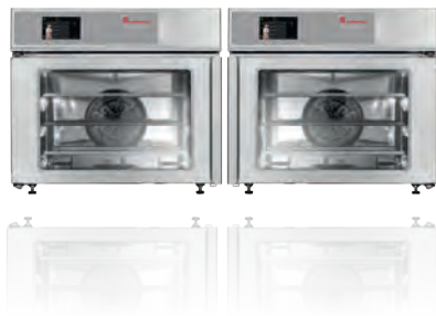
EB 30 MT

ELECTRIC Art.-Nr. EL0510348-1A Silver Panel