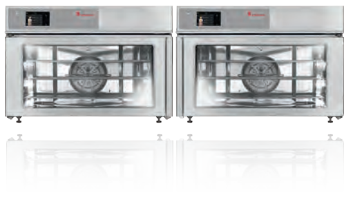
EB 30 XL MT

ELECTRIC Art.-Nr. EL0510367-1A Silver Panel