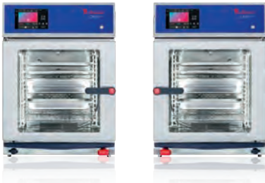
JOKER MT 2-3

All units are available with a silver control panel.