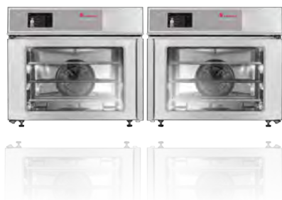
EB 30 MT

ELECTRIC Art.-Nr. EL0510348-1A Silver Panel