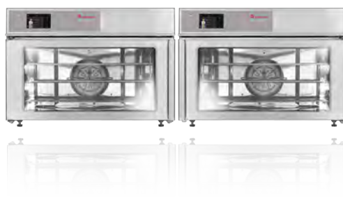
EB 30 XL MT

ELECTRIC Art.-Nr. EL0510367-1A Silver Panel